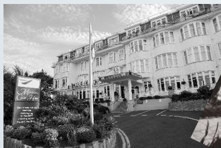
2018 - 95 Bedrooms