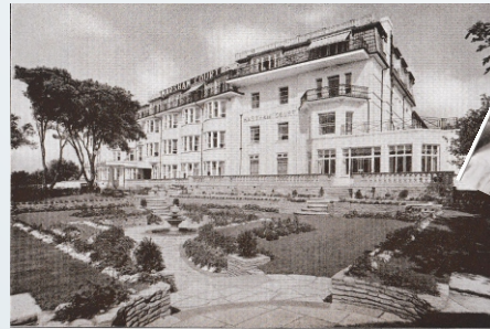
1936 - 110 Bedrooms