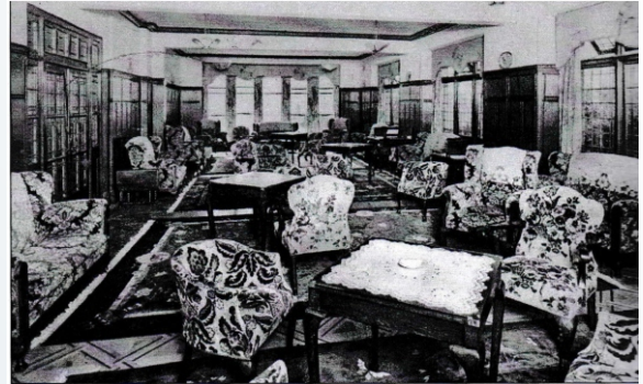
The Lounge Ballroom, Marsham Court

The Marsham Court had been the first hotel to have hot and cold water in the bedrooms. A year later the hotel was the American Red Cross headquarters and the HQ for the land registry and issuing instructions to only use the night lights provided in an emergency as they were difficult to obtain.