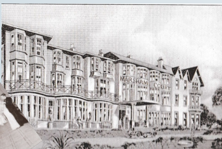
1929 - 74 Bedrooms