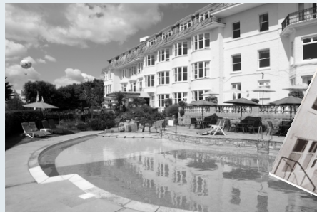
2002 - 87 Bedrooms