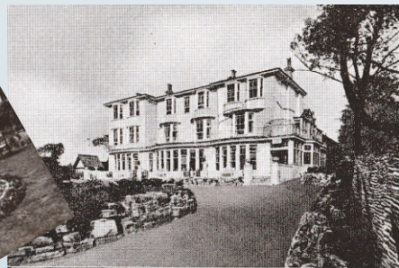
1923 - 41 Bedrooms