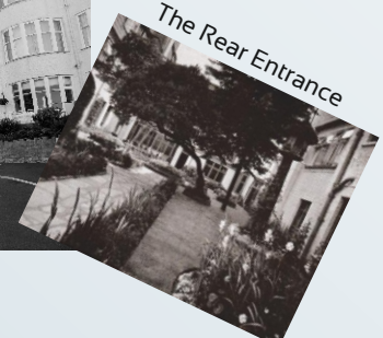
The Rear Entrance