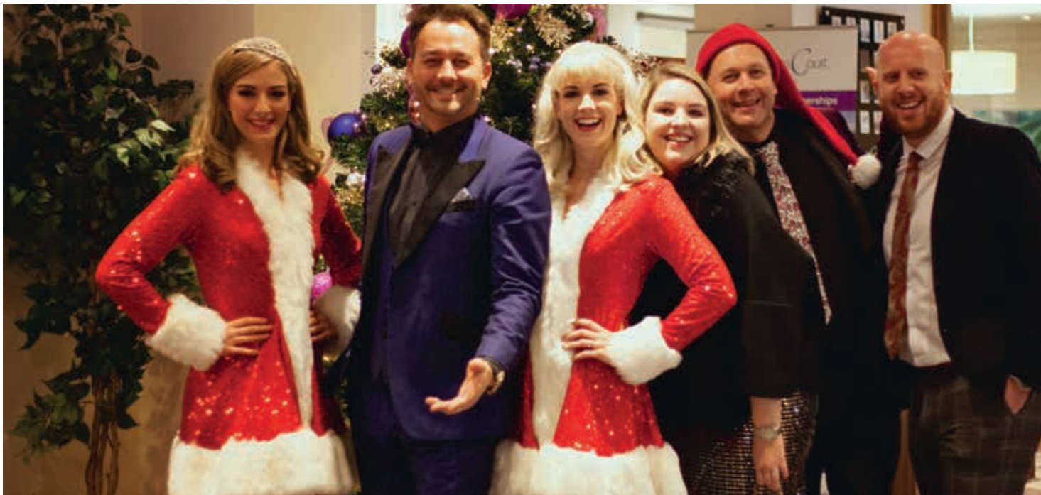
Local area photography courtesy of Bournemouth Tourism